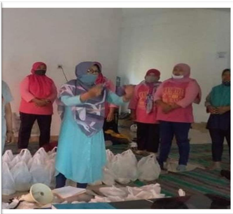
Photo: The campaign to encourage recognition and protection for informal workers as workers during the celebration of International Women's Day. The group held social services and collective action.

for women informal workers. This special day is commemorated by the women homeworkers' union, both organisationally and network allies, through joint actions, social services, distribution of necessities, information awareness about homeworkers as workers, and other related activities.