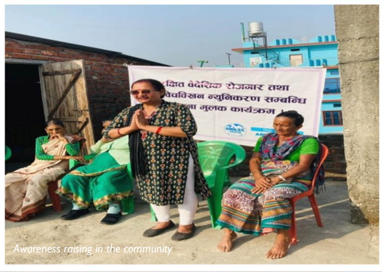
Awareness raising in the community